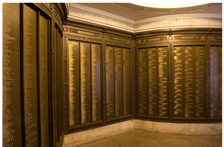
National War Memorial – Adelaide