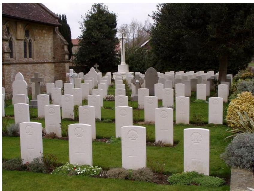
War Graves at Sutton Veny